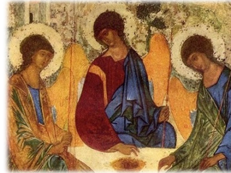
Holy Trinity by Andrei Rublev (d. ca. 1430)

Today's Feast of the Holy Trinity, contemplates the deepest mystery of our faith: that God is One, yet Three: Father, Son and Holy Spirit. This is not simply a puzzle for theologians to solve but a mystery and a truth to be lived. In today's Gospel, we hear those beautiful and familiar words: "God so loved the world that he gave his only Son." Here we glimpse the heart of the Trinity: the Father who loves, the Son who is given for our salvation, and the Spirit through whom that divine love is poured into our hearts. The Trinity reveals that at the centre of all reality