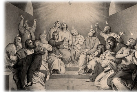
Tongues of Fire, Unknown https://commons.wikimedia.org/wiki/File:Tongues_of_fire_

Pentecost is often called the “birthday of the Church,” but it’s also a reminder that the Church is always being renewed and enlivened by the Holy Spirit. On that first Pentecost, people from many nations and languages gathered in Jerusalem, yet each one heard the Gospel proclaimed in a way they could understand. Diversity was not erased; it was embraced and transformed into unity through the power of the Spirit.