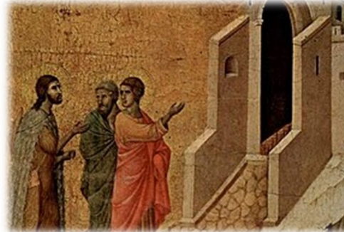
'Emmaus' by Duccio di Buoninsegna

On this Third Sunday of Easter, the Gospel invites us to walk alongside the disciples on the road to Emmaus - confused, discouraged, and yet unknowingly in the presence of the risen Lord. It's in the simple acts of journeying together, listening to the Word, and the breaking of bread that their eyes are opened and their hearts set ablaze.